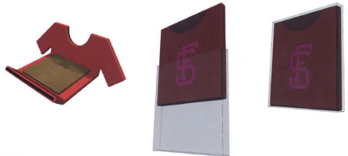
UNION Concept Custom T Shirt Display System

TSHIRTS ARE STILL OUR BREAD AND BUTTER. WE WANTED A NEW WAY TO SHOWCASE THEM. THIS IDEA WAS INSPIRED BY THE WAY HIGHEND RECORD SHOPS DISPLAY THEIR RARE VINYL. WE SHRINKWRAP EACH T AND WRAP IT IN THE SHAPE OF A RECORD. THEY ARE THEN DISPLAYED ON THE WALL AND IN A RECORD BIN, ORGANIZED BY DESIGNER.