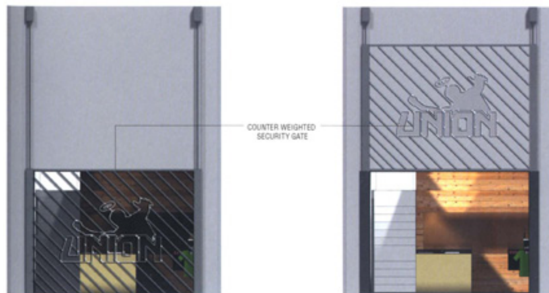
UNION Concept Facade

THIS WAS OUR FIRST OPTION. IT WAS DOPE LOOKING BUT STILL FUNCTIONAL. WE ENDED UP GOING FOR THE "BIG BOX" THOUGH (MORE BANG FOR THE BUCK) I STILL LOVE THE SMALL BOX AS A COMPANION TO THE BIG BOX... MAYBE WE'LL ADD THAT LATER.