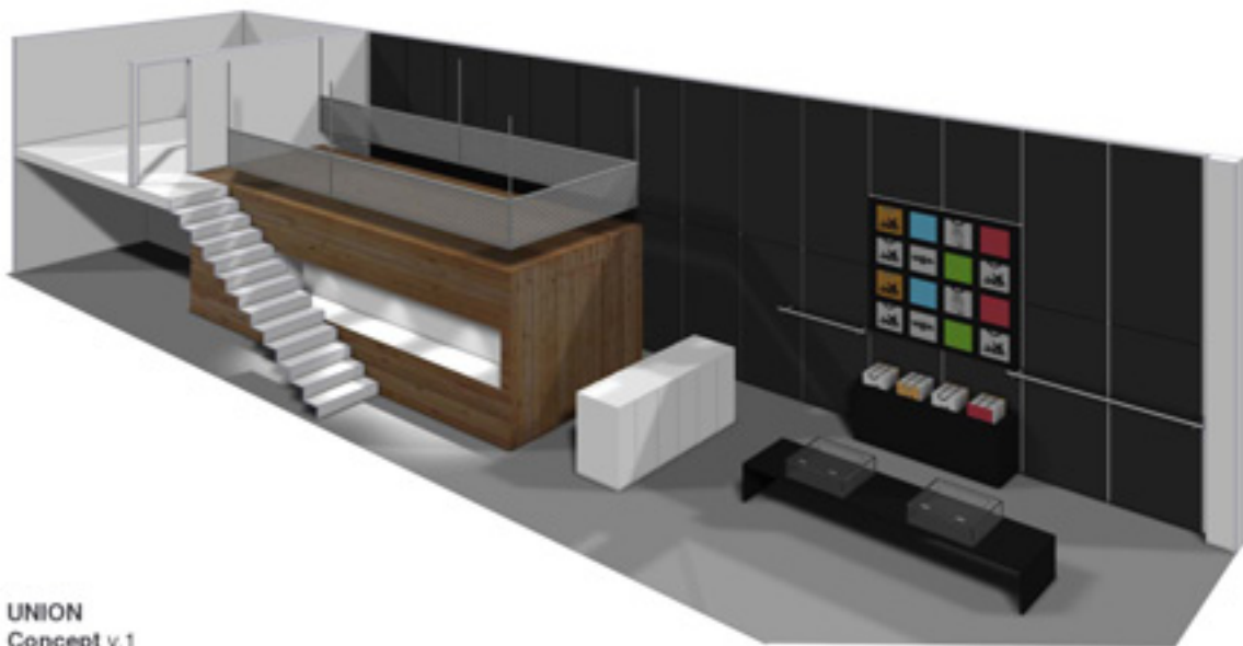
UNION Concept v.1

WE ENDED UP GOING WITH THE BIG BOX OPTION. WHAT CAN I SAY? IT MAKES THE STORE A PIECE OF ART! A TRULY DOPE AND ORIGINAL WAY TO HAVE A MEZZANINE LEVEL. LOVE IT!!!