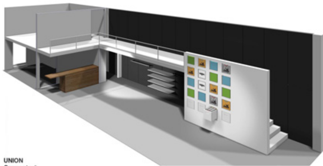
UNION Concept v.3

WE ENDED UP GOING WITH THE BIG BOX OPTION. WHAT CAN I SAY? IT MAKES THE STORE A PIECE OF ART! A TRULY DOPE AND ORIGINAL WAY TO HAVE A MEZZANINE LEVEL. LOVE IT!!!